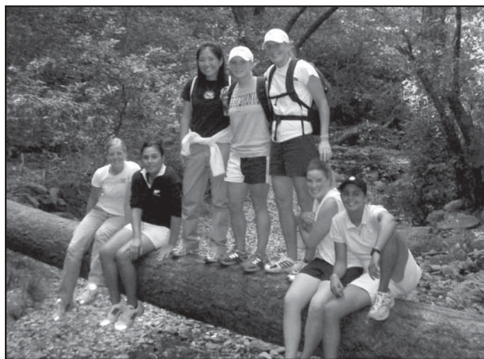
The team building program incorporates a variety of outings geared toward team bonding and goal setting.

The team members feel that teamwork is the ability to work together toward a common vision and to direct individual accomplishments toward organizational objectives. The Cal women's golf team also believes teamwork is the fuel that allows common people to attain uncommon