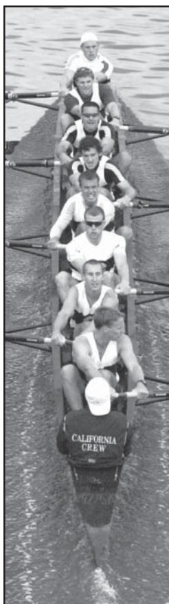
2003 Men's Varsity 8

Men's Basketball ..... NCAA (2nd Round) Men's Cross Country ..... NCAA Regionals Women's Cross Country . NCAA Regionals Field Hockey ..... NCAA (1st Round) Men's Golf ..... NCAA Regionals Women's Golf ..... NCAA (T14th place) Women's Gymnastics ..... NCAA Regionals Men's Soccer ..... NCAA (3rd Round) Women's Soccer ..... NCAA (2nd Round) Men's Track & Field ..... NCAA Nationals Women's Track & Field ... NCAA Nationals Volleyball ..... NCAA (2nd Round)