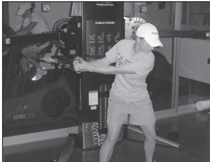
The Bears train with a variety of strength and flexibility exercises.

Cal features state-of-the-art weight rooms at Haas Pavilion and Memorial Stadium. The newer weight room at Haas Pavilion includes six Olympic platforms, more than 5,000 pounds of Olympic bars and bumper plates, and an array of aerobic and anaerobic equipment. The facility is brightly designed and overlooks Evans Baseball Diamond to the west. The 2000-